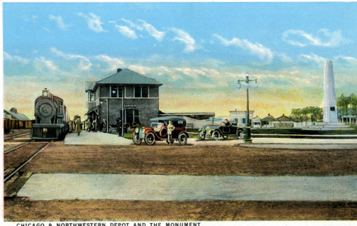
CHICAGO & NORTHWESTERN DEPOT AND THE MONUMENT.

Wyoming grew with the railroads. The Union Pacific Railroad across southern Wyoming was completed